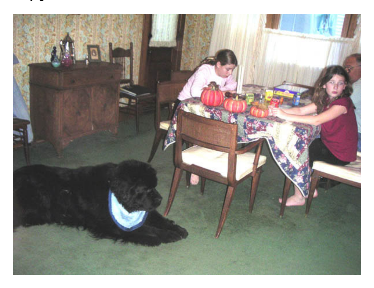
Having a Newfie is like having a bearskin rug in every room in the house.